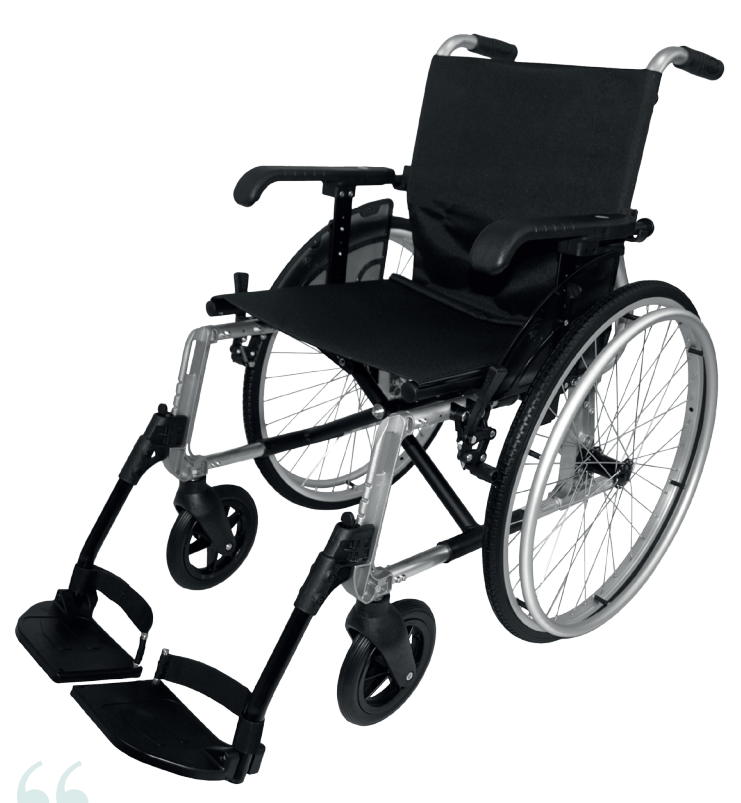
The perfect solution for giving users the best service during their travels. Not only suitable for airport terminals and train stations, but also for hotels or any type of establishment that seeks to provide the best service to its customers.